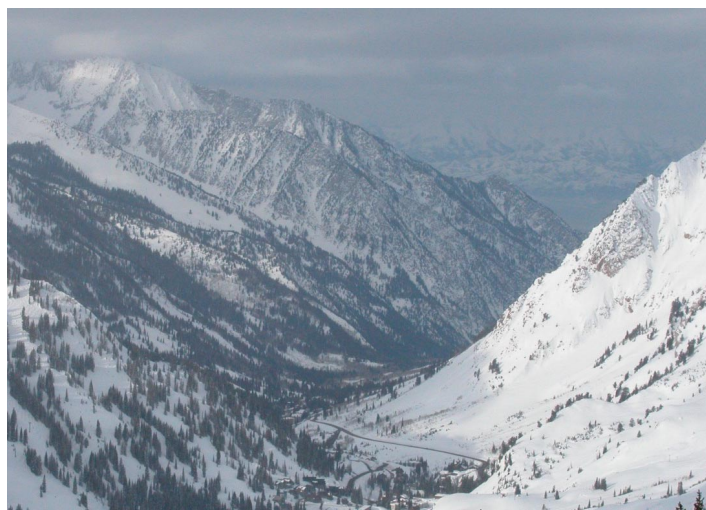
View of Little Cottonwood Canyon from Grizzly Gulch